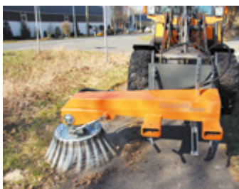
bema Groby with forklift attachment

Installation on: wheel loader up to 7 t, telehandler, yard loader, excavator, forklift (standard), municipal vehicle, tractor (front) Further mounting variants on request