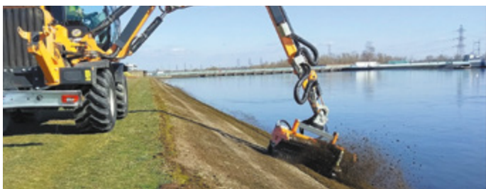
Sweeper built from the modular kit: bema 25 with bema Weed brush, without collection container, excavator mounting (special construction)