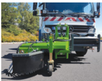
Special construction for more flexibility