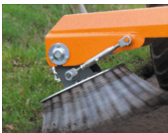
Mechanical inclination adjustment