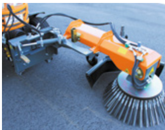
Hydraulic swivel device, approx. 85 ° to the left