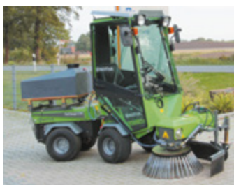
bema Groby light on a equipment carrier