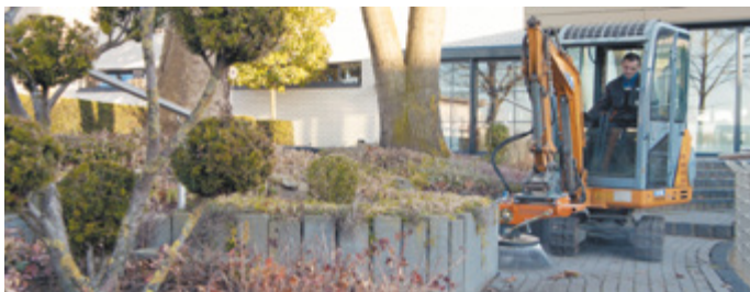
bema Groby light convices on various carrier vehicles, e.g. on a mini-excavator