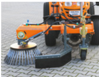
Flexible thanks to telescopic lateral movement (300 mm)