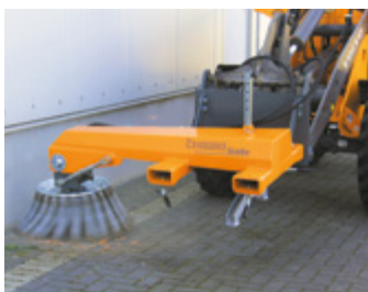
bema Groby on a wheel loader