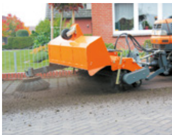
bema Sweeper equipped with bema Weed brush and rotary side brush

The combination of sweeper and weed brush makes a second work step superfluous, as the weeds can be picked up directly by the optional collection container. The additional equipment of the sweeper with a rotary side brush with weed trim sweeps up weeds growing in gutters and on curbs. The working width is between 1250 and 2300 mm depending on the model. In this way large areas are quickly and thoroughly cleared of weeds, moss and the like.