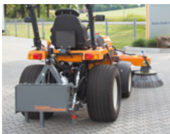
Upgrading with bema PowerPack - hydraulic power unit