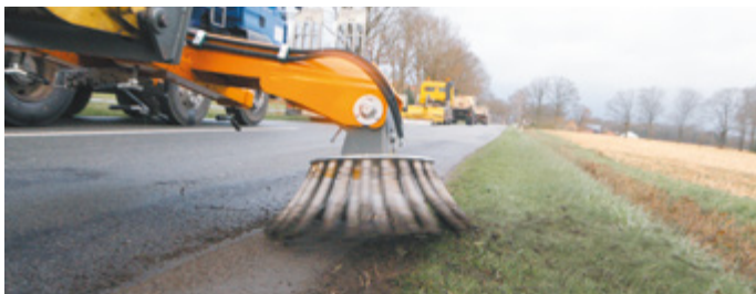
bema Groby is used for the care of road sides